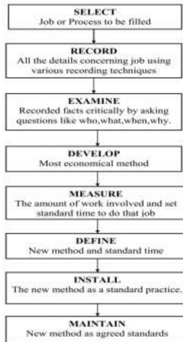
Fig 2 Steps involve in work study